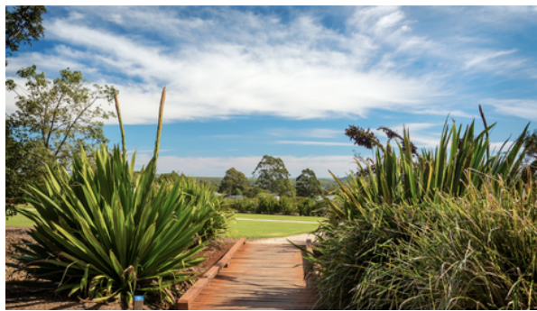
Peacehaven Botanic Park