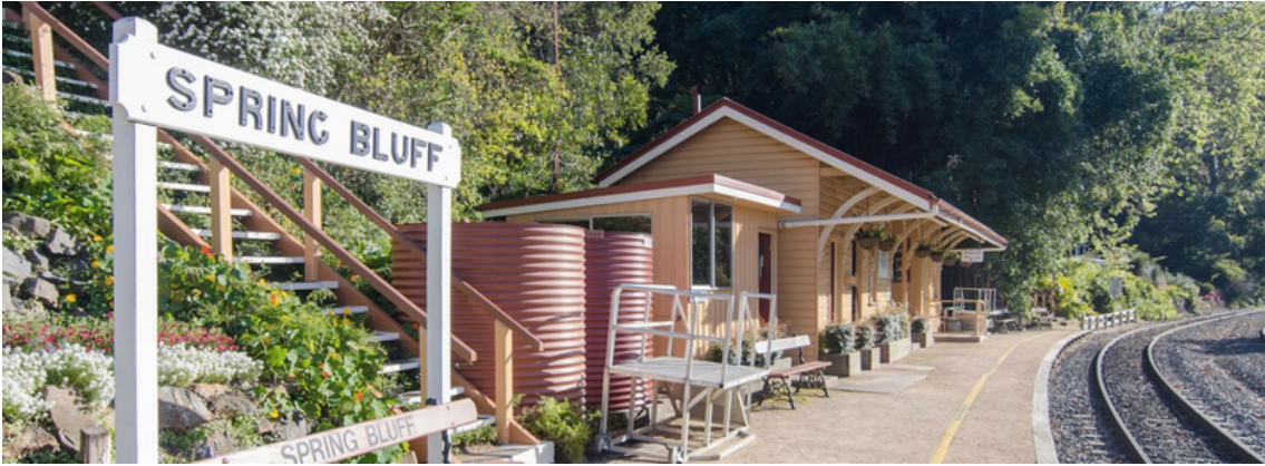
Spring Bluff Railway Station