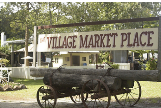
Highfields Pioneer Village