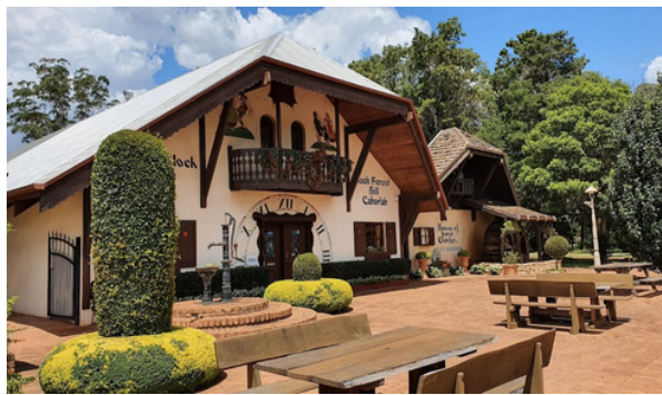
Black Forest Hill